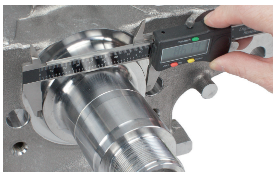
Fig. 2: In order to determine which of the three protective rings will fit, the diameter of the seal seat must be measured

For correct part selection, note that there are three different variants: In order to identify the appropriate protective ring, the diameter of the seal seat must be measured (Fig. 2).