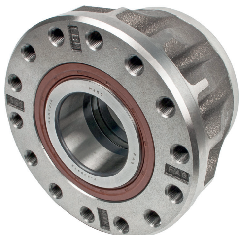
Fig. 2: FAG wheel bearing module 805993.H195

If, in the course of repairing axles marked with the ID S63U, S75U or T75U, a Timken wheel bearing is still installed, additional components must be replaced.